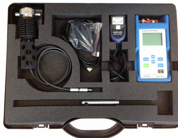
Fig. 5: Scope of delivery Type 2516B12