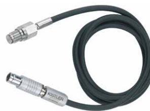
Fig. 6: Sensor Type 6619AP35