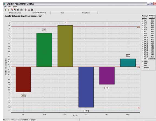
Fig. 3: Cylinder peak pressure deviation p_{av} of each individual cylinder compared to the calculated average peak pressure of the engine, before and after the maintenance work ("as found" / "as left")