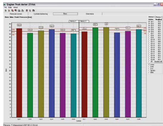
Fig. 4: Bar diagram