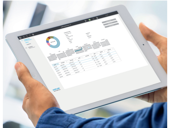
Fig. 1: ComoDataCenter 4 interface

The ComoDataCenter 4 contains a database, where the data recorded by the ComoNeo and CoMo Injection system is stored. A convenient user interface allows the user to view this data and analyze it during ongoing production. The entire system uses the indicators: Production order, production batch, article number, and mould number. The data can be exported to other systems easily with just a few clicks. A standard database is included in the scope of delivery for storing data. The ComoDataCenter 4 can however also be incorporated in existing customer databases.