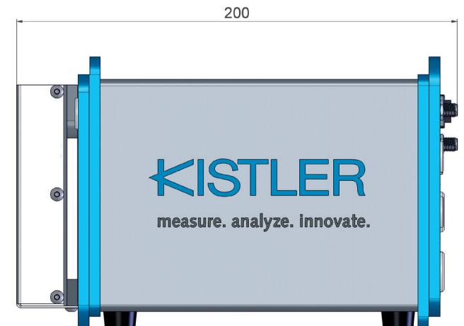
Fig. 1: Front and side view of the KiRoad Performance electronics unit