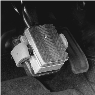
Fig. 1: Sensor mounted at the brake pedal