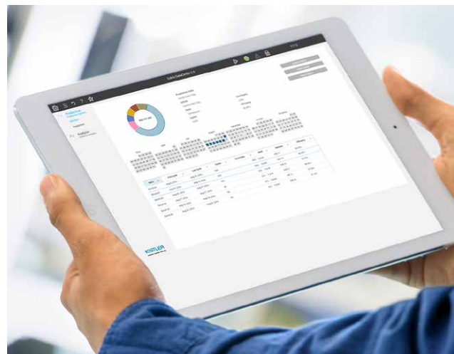
Fig. 1: ComoDataCenter 4 interface

The ComoDataCenter 4 contains a database, where the data recorded by the ComoNeo and CoMo Injection system is stored. A convenient user interface allows the user to view this data and analyze it during ongoing production. The entire system uses the indicators: Production order, production batch, article number, and mould number. The data can be exported to other systems easily with just a few clicks. A standard database is included in the scope of delivery for storing data. The ComoDataCenter 4 can however also be incorporated in existing customer databases.