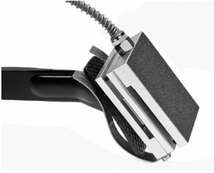
Fig 1: Sensor Type CPFTB mounted at the brake pedal