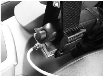
Fig. 2: Sensor Type CPFTB mounted at the hand brake lever of a car