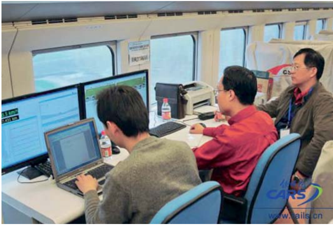
Dynamic performance supervision (source: CARS)

Kistler K-Beam®: Variable-Capacitance MEMS Sensors K-Beam accelerometers offer temperature stability between -55\text{ }^{\circ}\text{C} and 125\text{ }^{\circ}\text{C} combined with low noise levels, ensuring accurate measurement of low-frequency events – from DC up to the 1000 Hz bandwidth in the most challenging environments.