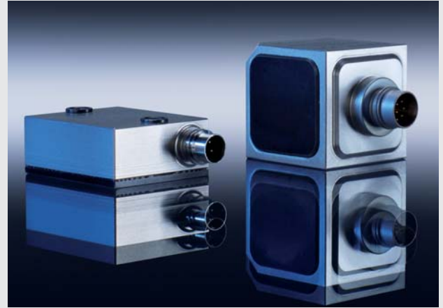
Kistler K-Beam® single axis Type 8315A and Triaxial Type 8395A

Kistler K-Beam®: Variable-Capacitance MEMS Sensors K-Beam accelerometers offer temperature stability between -55\text{ }^{\circ}\text{C} and 125\text{ }^{\circ}\text{C} combined with low noise levels, ensuring accurate measurement of low-frequency events – from DC up to the 1000 Hz bandwidth in the most challenging environments.