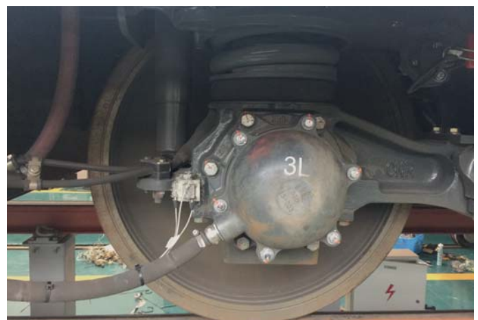
Three K-Beam® Type 8315A MEMS sensors installed on a high-speed train bogie at CARS

Passenger comfort and durability testing are requiring low frequency response MEMS capacitive sensors. Depending on the train, and subcomponent being tested, different g ranges were needed: 2 g for passenger level, 10 g, 30 g and 50 g for bogie level, and 100 g or 200 g for wheel set and pantograph level. In addition, the customer needed integral cable configuration, easy mounting, and last but not least direct compatibility with its IMC data acquisition system. The customer chose single axis Type 8315A, and triaxial Type 8395A for their integral cable capabilities, different output configuration to adapt to their data acquisition system, and long term and thermal stability performances. Once again, a stable supply chain together with many different type of output options and stable performances of Kistler product supported by a strong Kistler expert team are the main reasons for a successful collaboration.