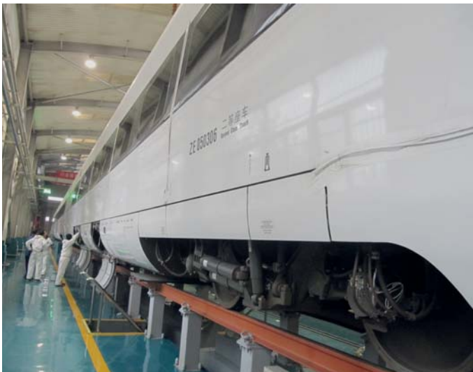
Kistler sensor installation at the Chinese Academy of Railway Sciences (CARS) for comfort and durability testing of high-speed trains

The Chinese Academy of Railway Sciences (CARS) is responsible for the commissioning work for high-speed lines of the majority of the Chinese network, as well as for train manufacturers. For this purpose, CARS must systematically test and evaluate the safety, smoothness and comfort of these high-speed lines to insure proper operation within the expected design speeds. Kistler has proven to be the right partner for Modal Analysis purposes, as well as durability and comfort testing.